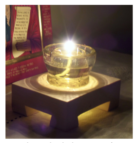
... the need to be born again from above...