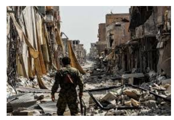
Collective sins of mankind